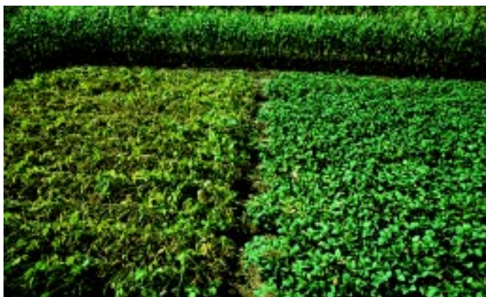
Symptoms of high infection (left) and low infection (right) levels of soybean rust within a soybean field.

Seedborne transmission has not been documented, although seed lots may contain contaminated plant debris capable of spreading the pathogen. Clouds of spores are released if infected plants are disturbed by wind or by individuals walking through rust-infected areas. Individuals who are sampling for soybean rust may transport spores from one area to another on clothing. If clothing is exposed to spores, care should be taken to prevent the spread of soybean rust to uninfected locations.