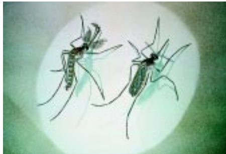
Male (left) and female (right) Culex mosquitoes.