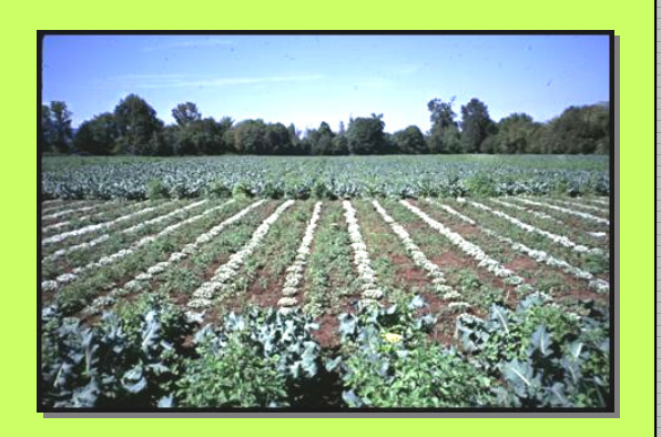
Block insectary planting of alyssum, Stahlbush Island Farms, OR

In plantings outside of the crop field, among hedgerow plants, or as perennial or annual plantings in crop margins: