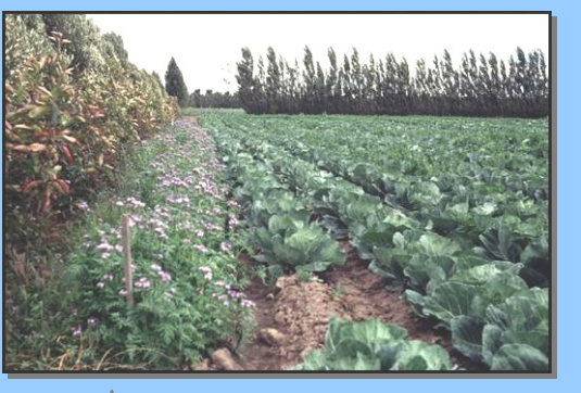
Annual border planting of phacelia in front of a hedgerow in New Zealand

In plantings outside of the crop field, among hedgerow plants, or as perennial or annual plantings in crop margins: