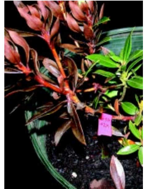
Kalmia latifolia 'Minuet' with severe foliar symptoms from P. ramorum.

laboratory). Plants infected with P. ramorum should be destroyed because no chemical control measures are currently available. Because P. ramorum is a regulated organism, destruction and disposal protocols will be coordinated by state regulatory officials. If diagnosticians confirm P. ramorum infestation of plants at nurseries or other commercial landscape facilities, an Emergency Action Order from APHIS may be issued. The order may require that P. ramorum -infected plants and all susceptible plants within 2 meters of infected plants be destroyed and that all susceptible plants within 10 meters be held for 90 days until inspected.